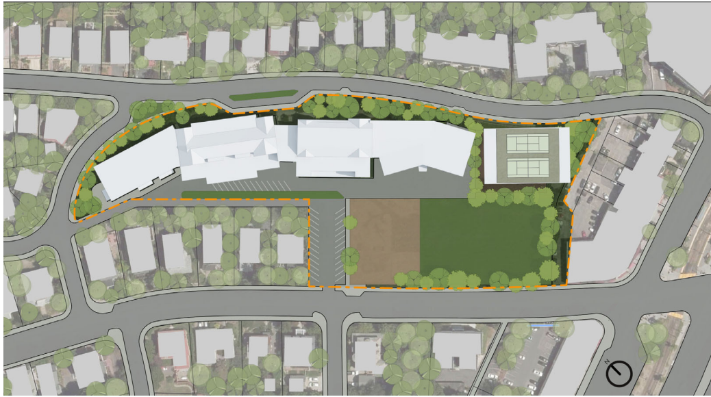
OPTION A "Code Renovation with East Addition - Off site swing space/temporary gym" & Option B "Right Size Renovation with East Addition - Off site swing space/temporary gym"