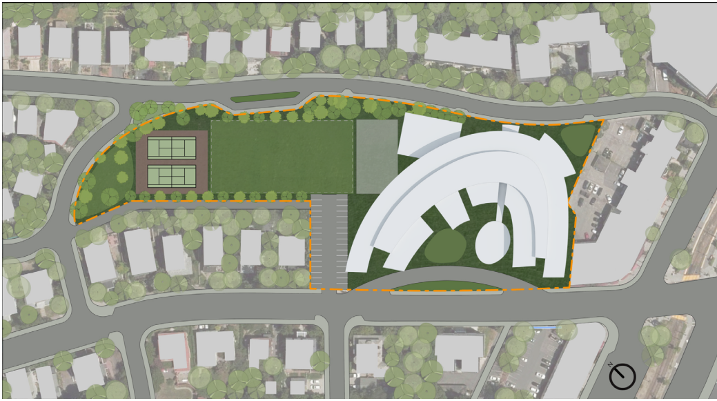
Option F "Magnet - New construction/occupied site/temporary gym"