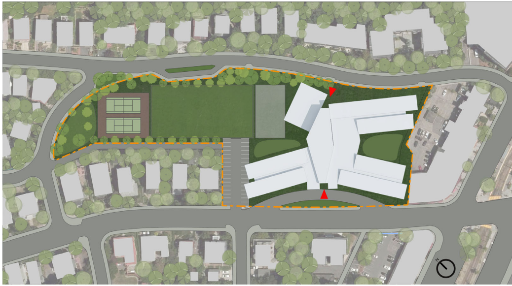
Option E "Star - New construction/occupied site/temporary gym"